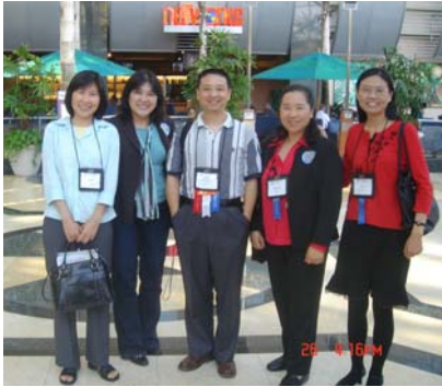
SICET members at AECT conference 2007