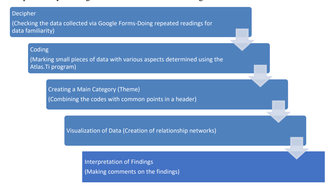
Figure 2. Qualitative data analysis steps

the connective behaviors of the participants. The coding phase was followed by the creation of the themes; At this stage, codes pointing to similar phenomena were brought together under inclusive headings. After determining the themes, deductive and inductive processes were operated by making forward and backward readings.